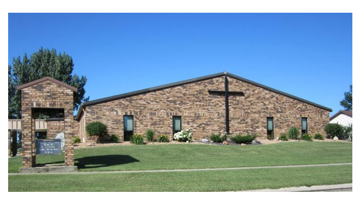
Thursday Mass: 9:00 a.m.

8:30 a.m. (Feb-Apr-Jun-Aug-Oct-Dec) 10:30 a.m. (Jan-Mar-May-Jul-Sep-Nov)