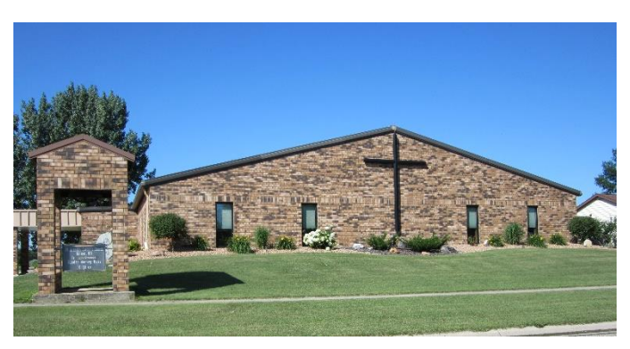
Thursday Mass: 9:00 a.m.

8:30 a.m. (Feb-Apr-Jun-Aug-Oct-Dec) 10:30 a.m. (Jan-Mar-May-Jul-Sep-Nov)